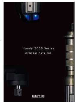
Handy 2000 Series GENERAL CATALOG